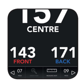
Fig 2 - App Power Save Mode