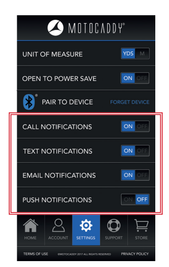
Fig 1 - App Settings

There are also other app specific notification settings within your phone that need to be enabled for the notifications to work. For a full list of compatible apps, plus individual app notification settings (including the 'Push Notifications' option), please visit www.motocaddy.com/support.