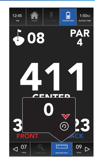
Fig 2a - Power Save mode