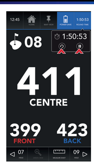
Fig 1a - Power Save mode

On the Measure Shot screen, use the left button to start and reset the shot distance measurement (fig. 2b).